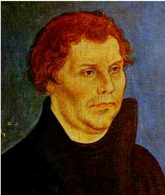
Oil on panel (1526), Lucas Cranach, Warburg-Stiftung, Eisenach, Germany