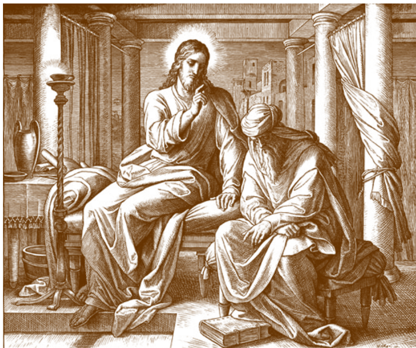
Die Bibel in Bildern, Julius Schnorr von Carolsfeld (1789-1853)

The Rosicrucian School has composed a syllabus that offers instruction in three different areas: Philosophy, Bible, and Spiritual Astrology, providing students with occult and mystical knowledge, based on the Western Wisdom Teachings, to safeguard and to protect them. If the aspirant wishes to be more efficient in the work of the invisible helper, he may seek for further knowledge, partic-