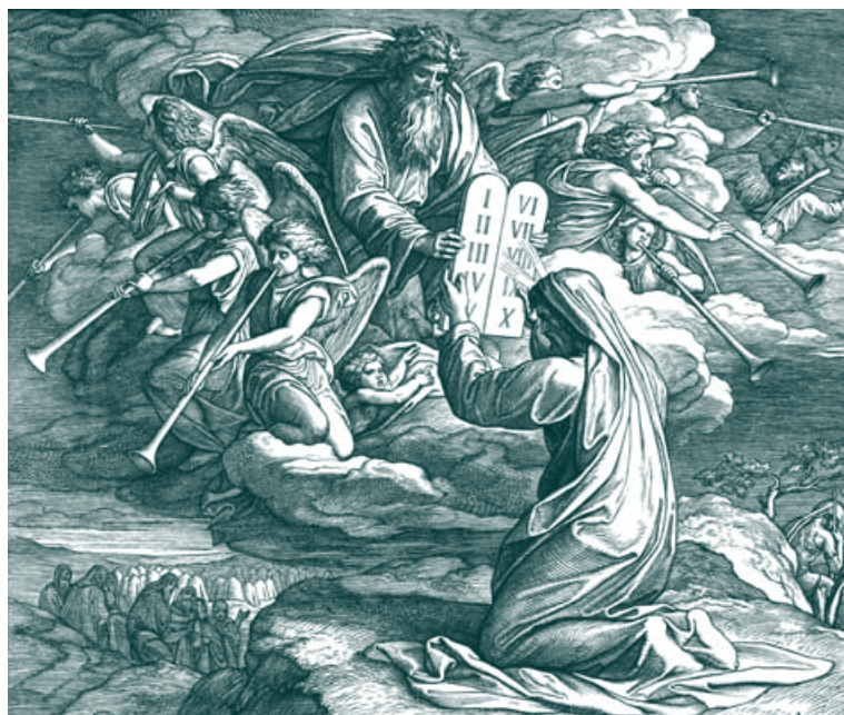
Die Bibel in Bildern, Julius Schnorr von Carolsfeld (1789-1853)