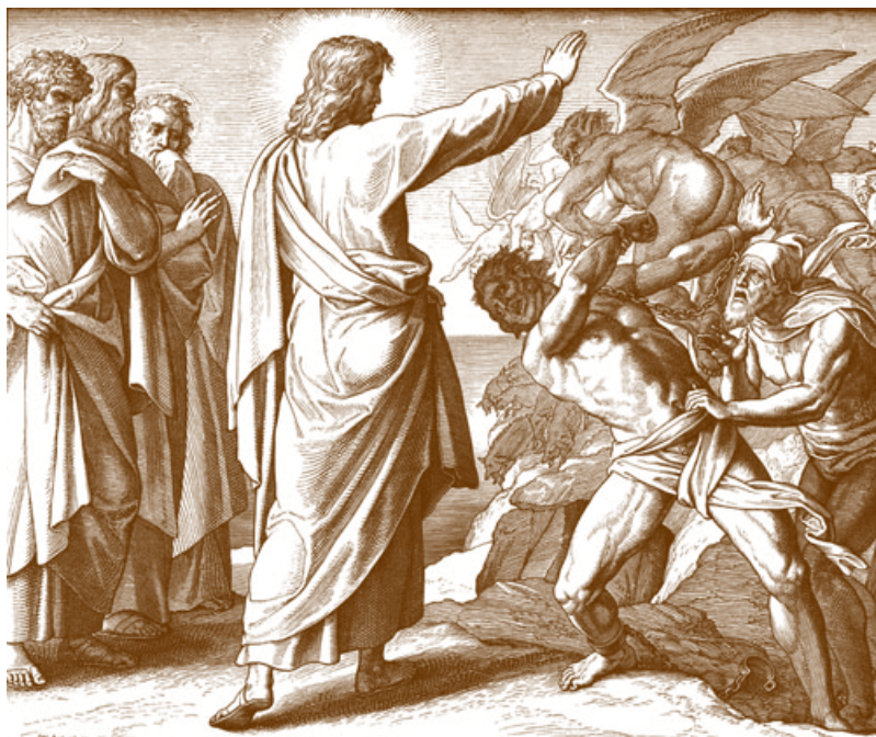
Die Bibel in Bildern, Julius Schnorr von Carolsfeld (1789-1853)

One of the theses put forth to solve the Incarnation Mystery is that at the baptism the personality of Jesus was “overshadowed” and interpenetrated inductively by Christ. This thesis is usually advanced by nonChristian mystics or by those who do not like to face hard issues like pain and suffering. It is objectionable for the same reason that the proposition that Jesus did not die on the cross is not a viable answer to the Crucifixion Mystery—if true, they would defeat the whole purpose of the Incarnation and the Crucifixion: to bring divine grace and salvation directly into our sphere through a being that had experienced this world and the sinful human condition. It would make the Incarnation and Crucifixion a sham. We are not saved by an inductive association with Christ but by a direct, living, internal bond with Christ who knows us and lives in us as we live in Christ. The Rosicrucian philosophy, based on carefully corroborated, trained seership, would seem to reject this thesis outright because it is not based on observed facts—facts such as the dense physical and vital