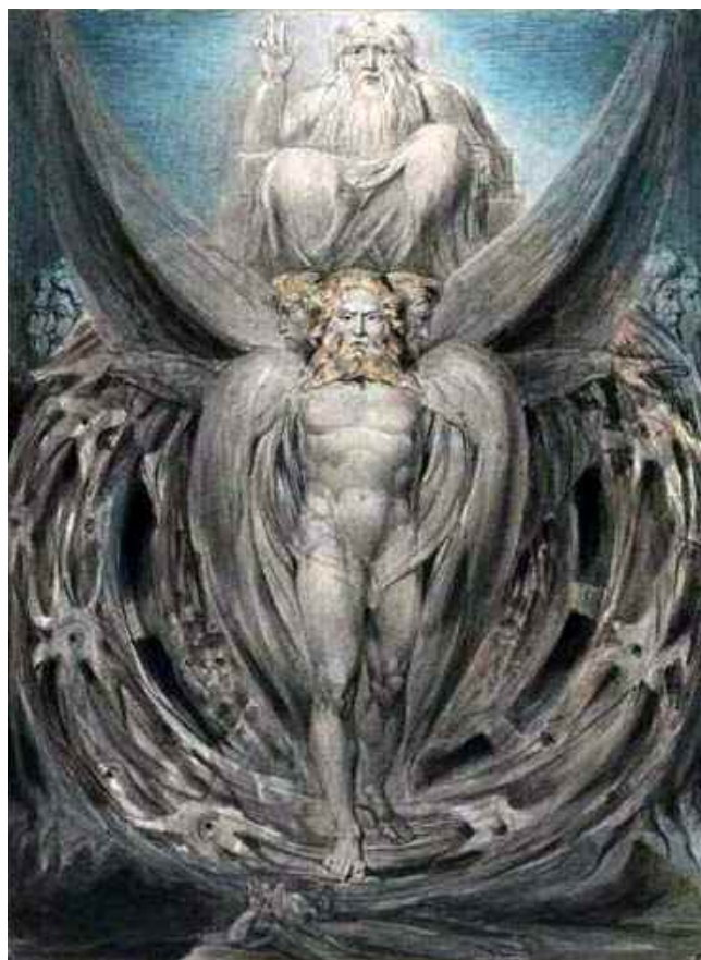
William Blake (1757-1827), watercolor, Museum of Fine Arts, Boston

The Cherubim described by Ezekiel are called the Spirits of the Wheels which are Thrones; that is, they govern the Wheels. In the Revised Standard King James Bible we read: “In the midst of the living creatures there was something that looked like burning coals of fire, like torches moving to and fro among the living creatures.” Since they rule the Wheels of star gods, they are Time