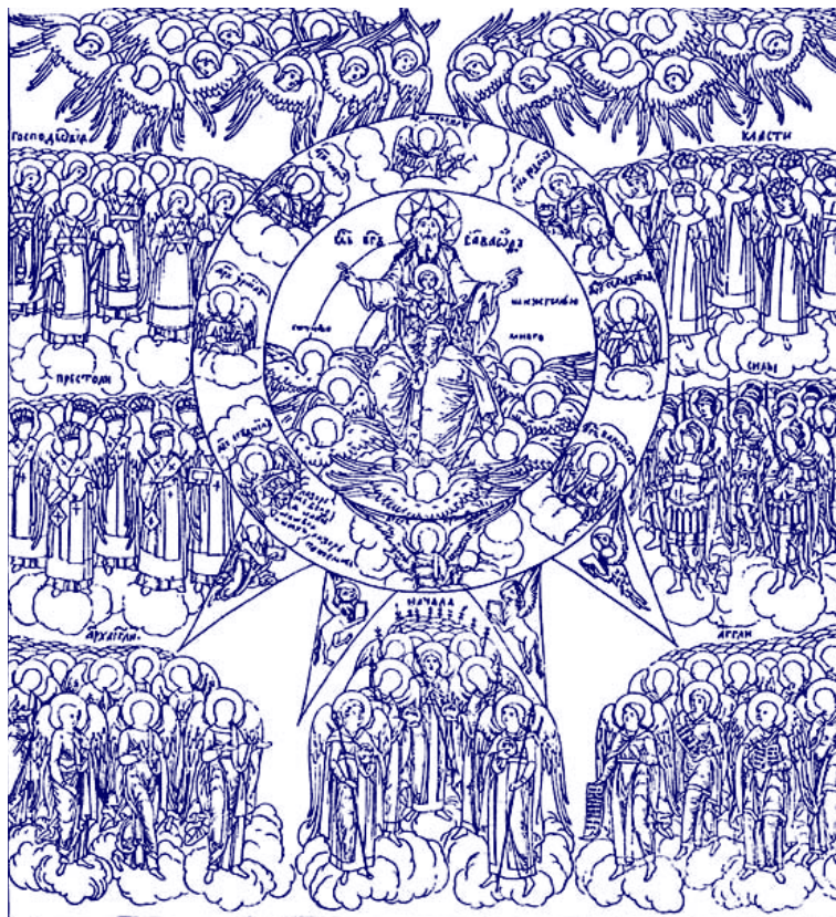
Seventeenth century sketch for a Russian icon of the nine orders of angels enveloping and obedient to the Christian Trinity.

On page 221 we see that the Hierarchies which came from Aries and Taurus did a little work in the very dawn of the Saturn Period and then went on