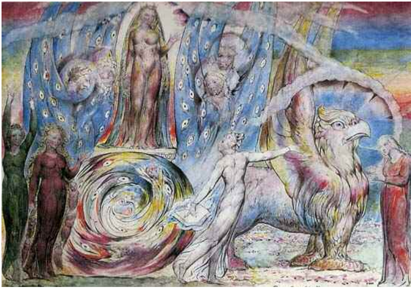
Watercolor, William Blake, Tate Gallery, London