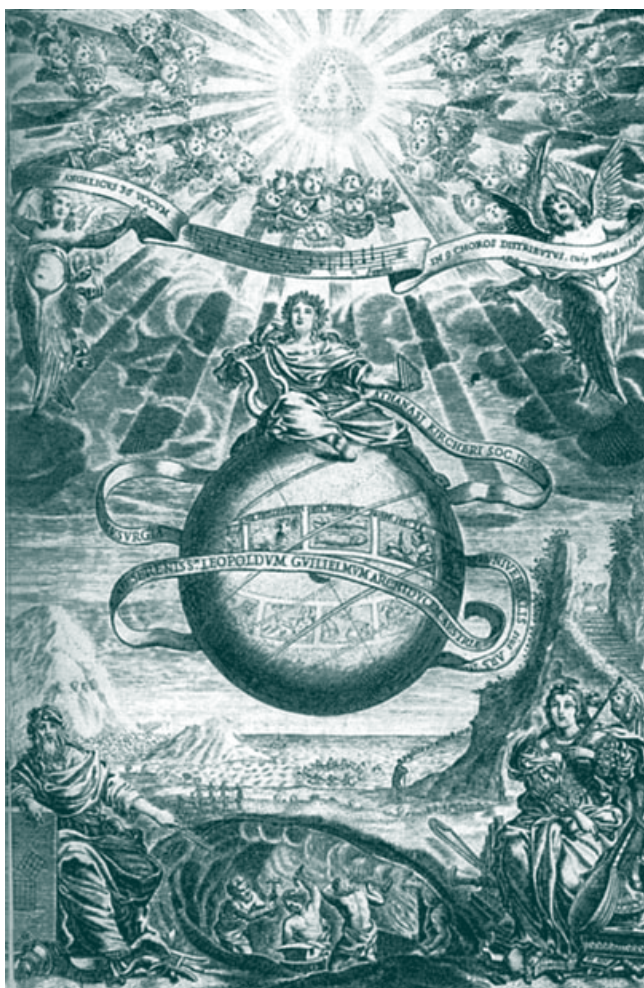
A. Kircher, Musurgia universalis , Rome, 1650, Stadtbibliothek Mainz

We are wounded by our transgressions, bruised by our iniquities. Before a physical malady can be healed permanently, the hearts and minds of men must be cleansed of evil, which is a misapplication of natural law. We must realize that every practice that is not in keeping with the ethics of a lofty mind and noble soul is a source of evil or separation, culminating in disease. Sickness, suffering, and death are the work of antagonistic forces within ourselves. Health can only be fully restored through obedience to the laws which coordinate the forces of good, obviating the need for the restoration of any violated equilibrium, physically and morally, in the universe, and thus rendering natural law harmoniously operative.