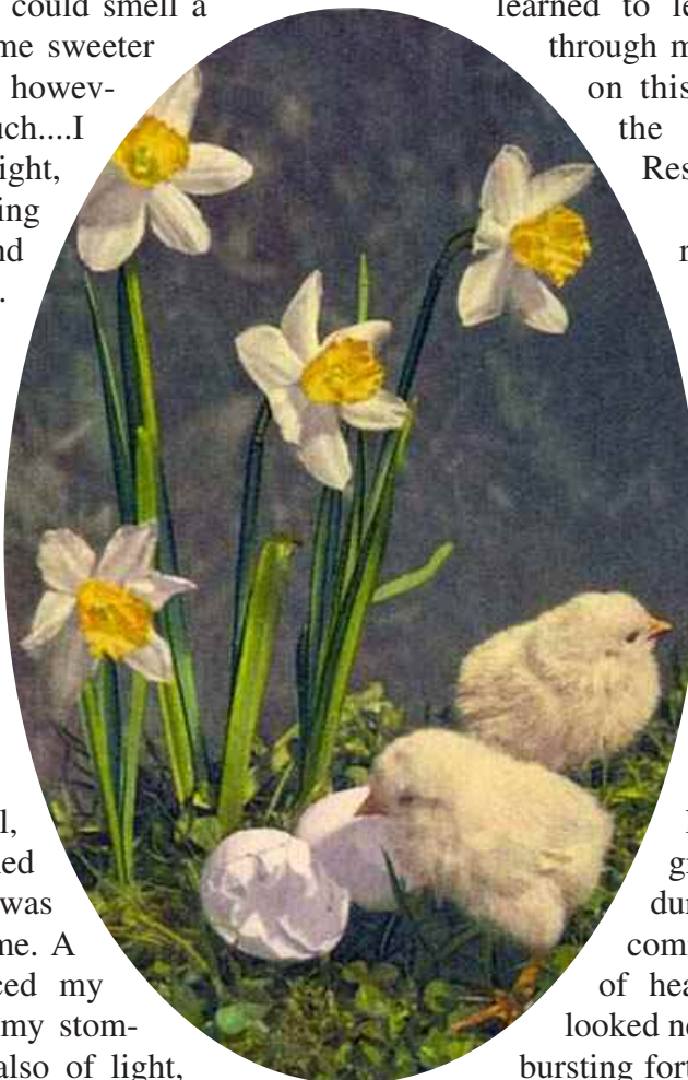
Thor & Gyger

When one of my neighbors came in to see me,