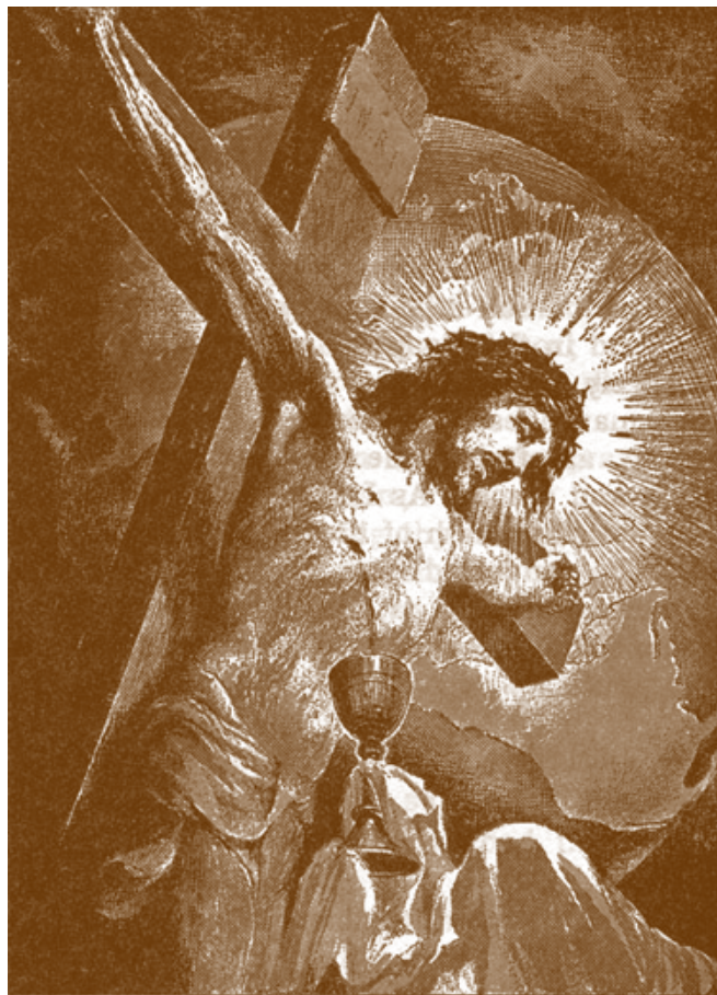
Created by Ariel Agemian exclusively for the Confraternity of the Precious Blood

One of the characteristics of that “fantastic” wisdom would have been that it produced no universal human truth at all; instead of that, importance would be attached to “geographical” “truths” “founded on blood-ties,” with their origin not in Heaven, but in earth and blood. For instance, there would be one “logic” and one world-conception on American soil and another world-conception on the soil of Eastern Europe. And the visions of one group of men united by blood-ties would be different from the visions arising from the blood of another such group. Different gods and demons,