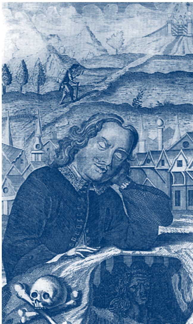
Frontispiece of John Bunyan's The Pilgrim's Progress

Each minister is given a pair of glasses, colored according to the particular creed which he represents, and woe betide him if ever he dares to look at the Bible save with those spectacles upon his nose; to do so means financial ruin and social ostracism which very few are brave enough to face. So long as the minister keeps his denominational