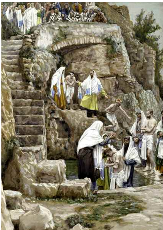
Watercolor.

All pre-Christian initiation was based on the principle of ecstasy. The extreme and complete form consisted in the neophyte being placed into the deathlike temple sleep, the 'mystical death,' after