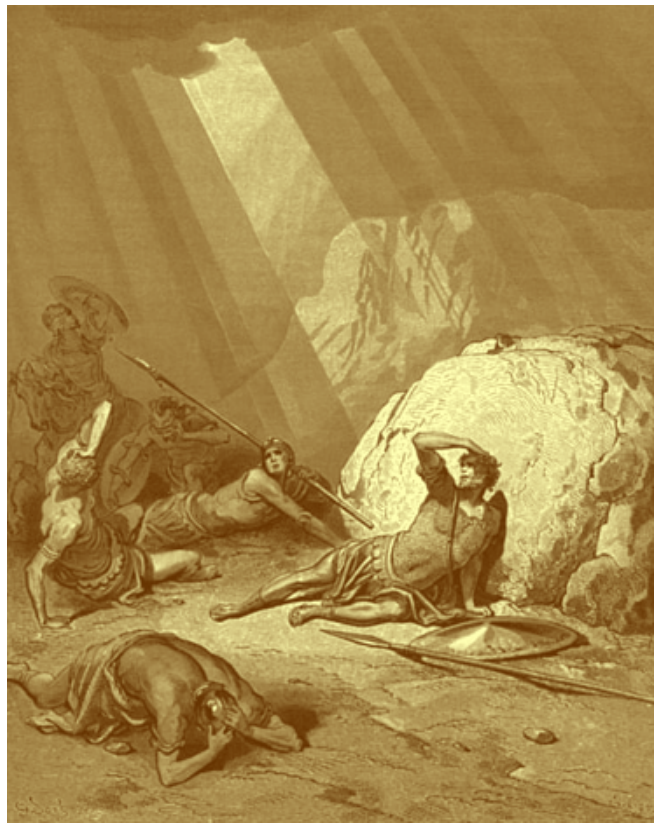
Engraving, Gustave Doré (1833-1883), for Acts 9:4

A 'confirmation' in the exact sense, an acknowledgment and strengthening of man's innermost being, took place through the baptism by fire and the Spirit. The first part of the dual rite of baptism, carried out predominantly with water, had relinquished the magical initiation character of John's baptism. It represented the symbolic conclusion and sealing of the catharsis, the purification by which the one who wished to fit into the community of Christ had prepared himself. By means of this baptism, the vessel was made ready and worthy of receiving something. The baptism with the Holy Spirit brought to life the higher content in the vessel. As in the course of time the first part turned into the baptism carried out on the child, and the second into the confirmation of the young person, the archetypal relationship becomes even more evident.