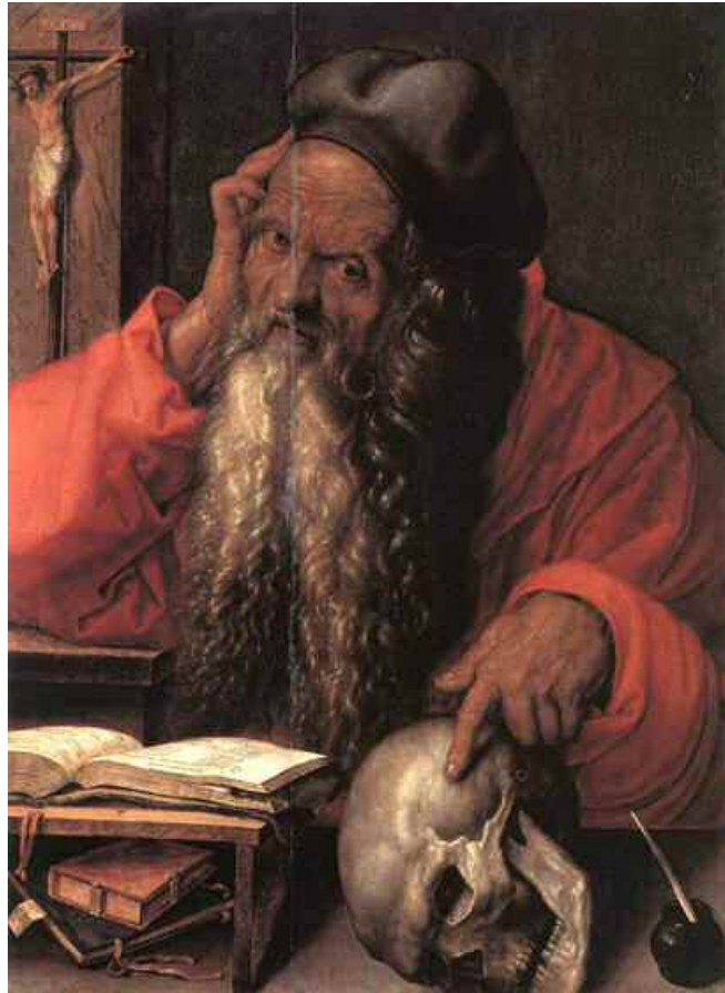
Oil on panel, 1521, Albrecht Dürer (1471-1528). Museu Nacional de Arte Antiga, Lisbon By the time of St. Jerome (340-420), the Bible canon was basically in place. He is shown contemplating human mortality but also the power over death through the crucified Christ. The first known crucifix did not appear until 200 years later.

While all the text comprising what we now know as the New Testament was written in the first century, indeed during its middle decades, with the exception of John's gospel, few apostles did not write gospels, epistles, acts, or revelations—if the multiple references to them by famous Church