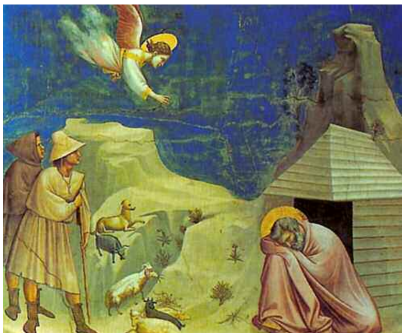
Fresco, 1304-06, Giotto (1266-1336), Scrovegni Chapel, Padua

For example, The Gospel of the Birth of Mary , known to exist, at least in title, in earliest Christian times, was attributed to St. Matthew and found in the works of St. Jerome. Paintings by Giotto and other Renaissance artists are based on incidents described in both this gospel and the Protevangelion (literally “the first good news”), an account of the birth of Mary and Jesus by James the Lesser, one of the original apostles and the first bishop of Jerusalem. This latter work enjoyed general credit in the Christian world, though controversies, arising over the alleged age of Joseph at the birth of Christ and the fact that he was a widower before his marriage to the Virgin, did not deter Epiphanius, Chrysostom (337-407), Cyril, and in fact all the Latin fathers until Ambrose, from quoting these details about Joseph, basing them on the accepted authority of the Protevangelion . We do know that history, particularly religious history, is often writ-