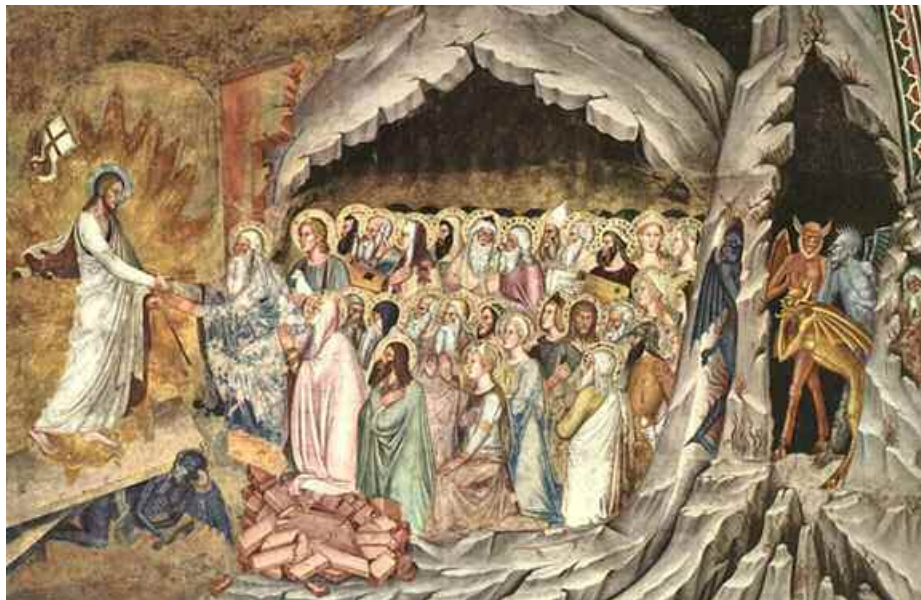
Fresco, Andrea da Firenze (1343-1377), S. Maria Novella, Florence

This gospel narrates Nicodemus' defense of