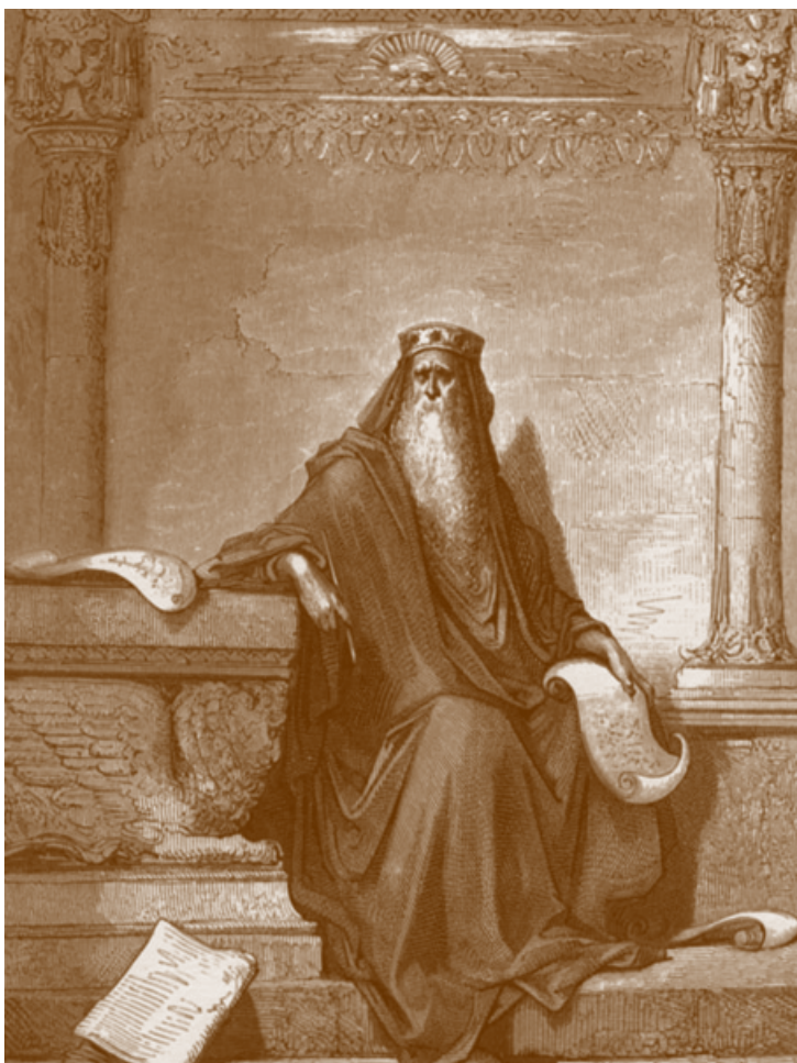
Gustave Doré (1833-1883)

“But men say that this is not to be understood as pertaining to this life on earth. If this is so, what does the following mean: ‘Who shall conform you even to the end,’ for in the Kingdom of God there is no end, therefore in this earthly condition will