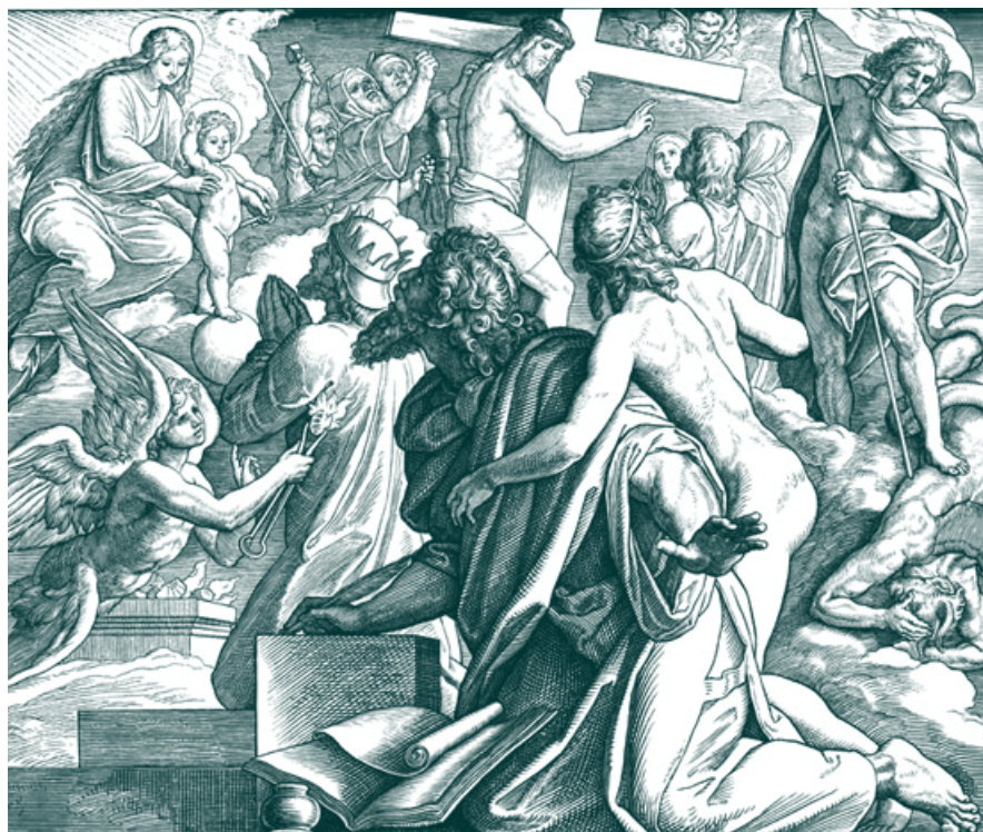
From Die Bibel in Bildern , Julius Schnorr von Carolsfeld (1789-1853)

Finally, we are taught by the Holy Scripture what we must do in general and in particular in order to attain a pearl of such incomparable worth. What we must do in general is indicated by the Apostle thus: "We beseech you, brethren, that ye increase more and more; and that ye study to be quiet, and to do your own business, and to work with your own hands, as we commanded you; that ye may walk honestly toward them that are without,