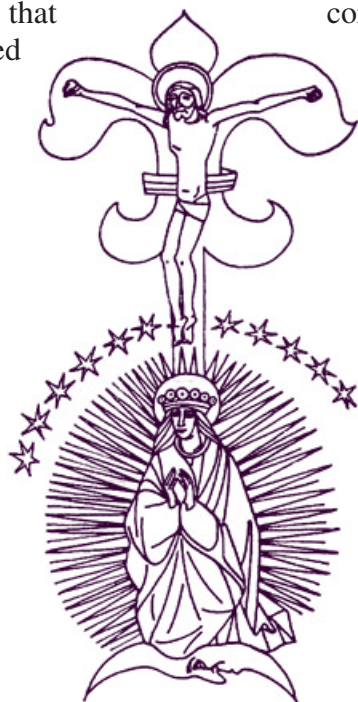
Book of the Holy Trinity, Staatsbibliothek, Munich This alchemical drawing shows the cross of Christ as a three-petaled, two-leafed lily, representing the quintessence, growing out of the Holy Virgin, who, as the Mother of God, corresponds to materia prima.

In just this way the Alchemist transmutes the apparent forms into occult ones by finding the general form through destruction of the specific one. This is the work of the true and divine Alchemy, through the mediation of which the earthly has been opened to the entry of the joys of Paradise so that men may pluck that red rose with the lilies of the field and taste of the Tree of Life. This is also taught by the Apostle when he says: "That ye may be able to comprehend with all saints what is the breadth, and length, and depth, and height, and to know the love of Christ, that ye may be filled with all the fullness of God" (Eph. 3:18). Thus the truly wise Artist will