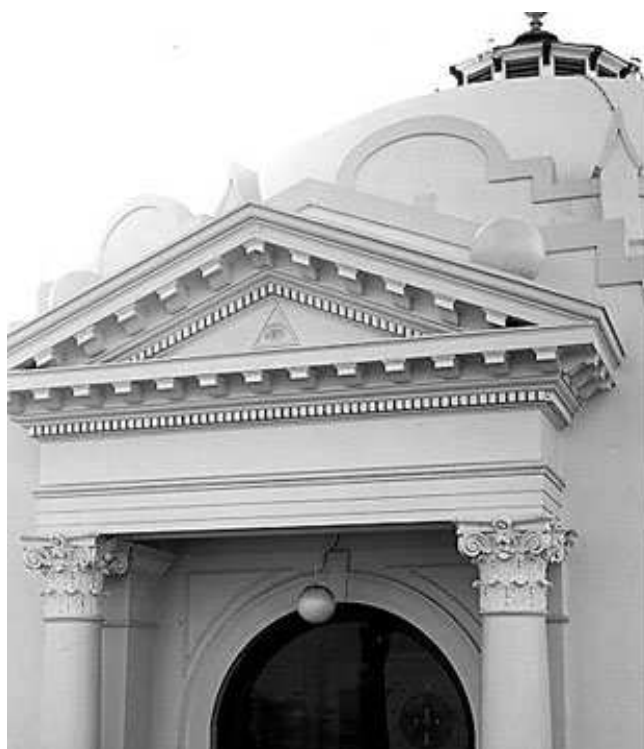
Portion of the eastern facade of temple showing composite capitols, entablature, pediment framed by elaborate cornice, trinity symbol inscribed by "the eye of God," and the finial directly above right pilaster (behind right column).

Today, as we stand at the most easterly portion of Ecclesia point and face West, we look directly at the eastern half of the Temple. We view its great dome surmounted by a cupola and above that by a golden globe and finally a cluster of lights. The beautiful symbolism expressed by these objects we shall review after we have examined another symbol found in the baldachino, the canopy over the Altar in the Sanctuary of the Temple. As our eyes descend from the Temple dome, they come to the portico—the east entrance of the Temple, which