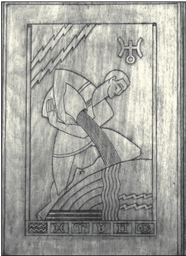
Detail from south (left) door to Healing Temple showing the Aquarius panel subscribed by six astrological symbols.