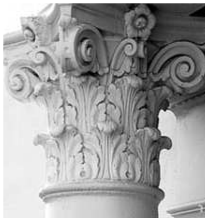
Capitol displaying four volutes, four flowers, and two ranks of acanthus leaves.

In ancient temples and in all modern Masonic temples, the two