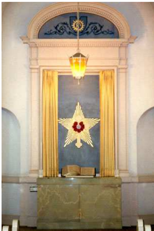
View of altar alcove, showing Bible, open at the first chapter of St. John's Gospel, Fellowship emblem, and semicircular baldachino. Roses in vases are not present.

From the lower point of this emblematic heart, a vine spreads to the right and to the left over the blue background. Midway along its two lengths, the vine branches into two sections, one on either side bending upward and back toward the emblematic heart, and each ending in a bright blue five-petaled flower with a gold center. We have seen this vine