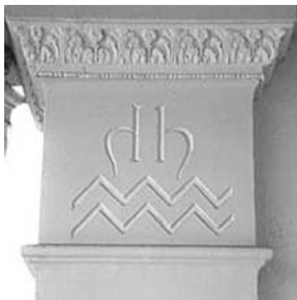
Stylized capitol of south pilaster with double Saturn symbols, signifying the discipline aspect of Aquarian service.

bell-shaped capitols garlanded with acanthus leaves, which