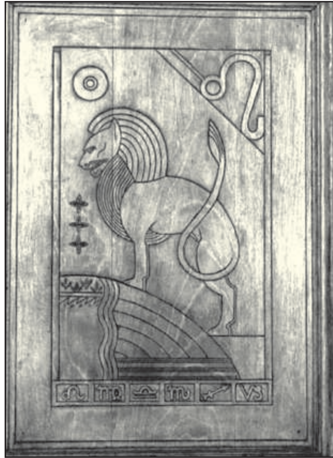
Detail of north (right) door to Healing Temple bearing the Leo panel with subscription of six astrological symbols.

out from the Temple walls, each showing two faces. They present the same outline of base, stem, and capitol as the columns, except they are square and the columns are round. Their square capitols show one row of acanthus leaves, separated in sections by a five-petaled flower with a deep center. On the inward-facing portion of each pilaster capitol are astrological signs. Uranus is depicted over Aquarius on the right or north pilaster capitol and on the left or south pilaster capitol a double Saturn appears over Aquarius, both markings symbolically alluding to the new Aquarian Age and its dominant signs. We may note that the double sign of Saturn is said to represent both generation and regeneration.