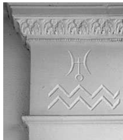
Capitol of north pilaster bearing the symbol for Uranus, signifying the impersonal love of Aquarian service.

dimensions of life. If we were to extend a line through the center