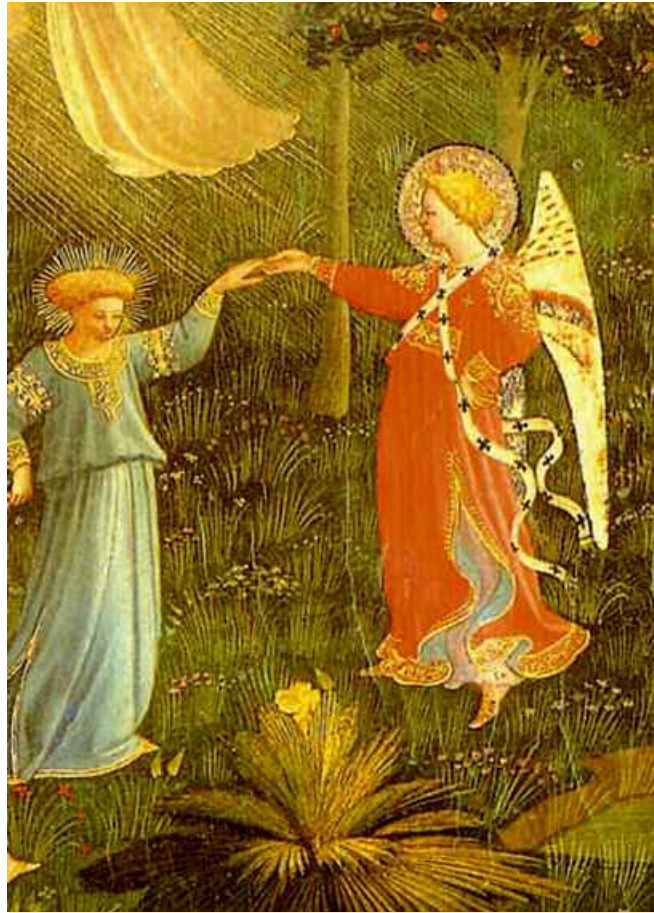
Detail from The Last Judgment , Fra Angelico (1387-1455), Museum of San Marco, Florence

Prior to birth, when the Recording Angels are building the archetype for a person's life, they plan various learning and serving opportunities for that individual. If, during life, that person neglects to take advantage of the learning and serving opportunities given and turns onto a path which is of little value to his or other people's soul growth, the